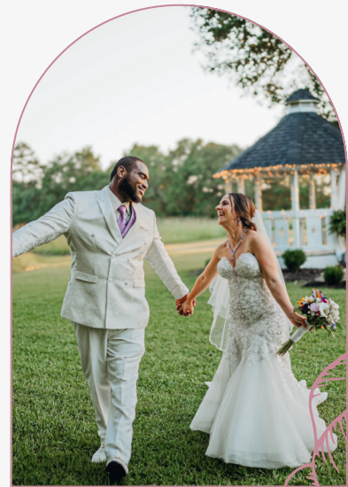
Sixteen Roses Photography