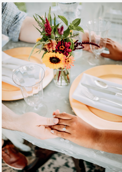
Amber Starr Photography

Special Events -Venue Rental Only- 4 Hours Total - 40 Guests | Starting at $650